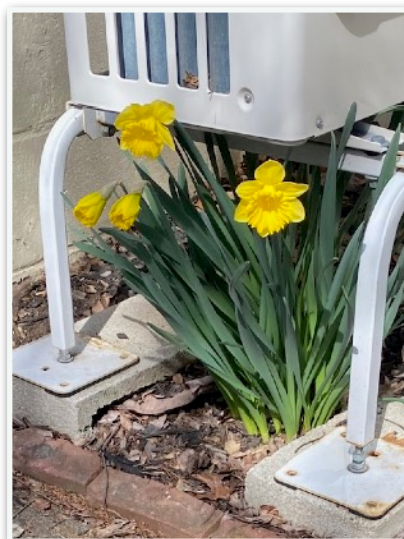
Signs of Spring

During the month of March we collected 182 pounds of food.