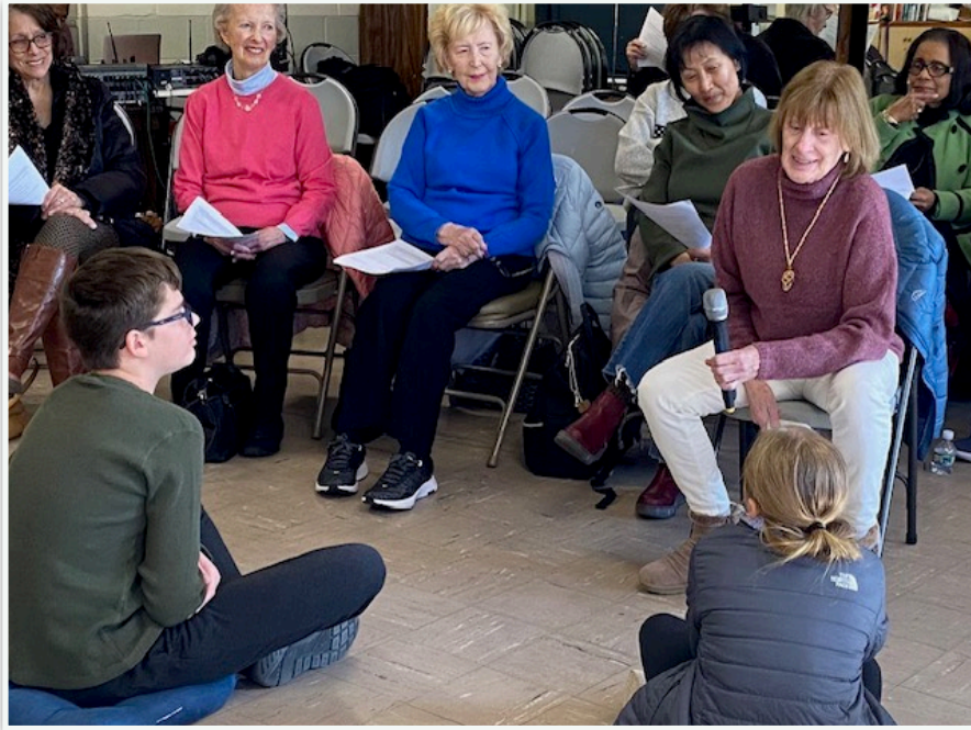
A lovely reader